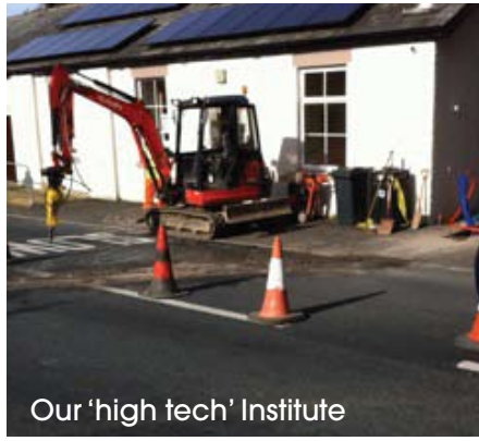
Our 'high tech' Institute