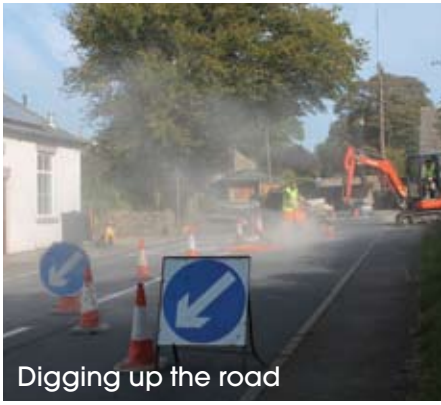
Digging up the road