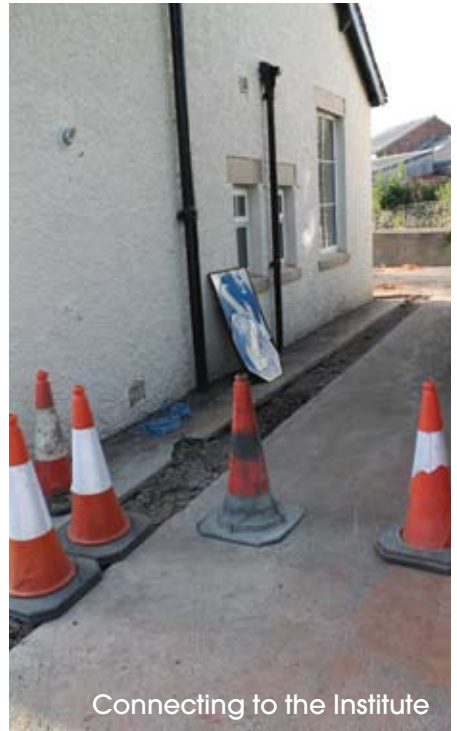
Connecting to the Institute